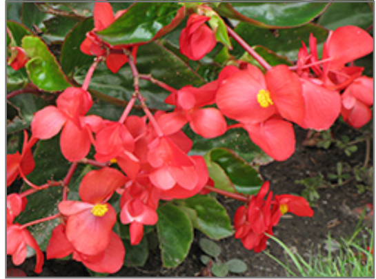
Dragon Wing Red Begonia flowers

Dragon Wing Red Begonia is recommended for the following landscape applications;