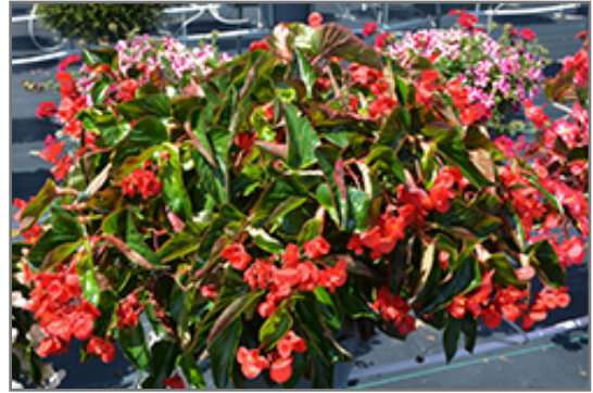
Dragon Wing Red Begonia in bloom

Dragon Wing Red Begonia will grow to be about 15 inches tall at maturity, with a spread of 18 inches. When grown in masses or used as a bedding plant, individual plants should be spaced approximately 15 inches apart. Its foliage tends to remain dense right to the ground, not requiring facer plants in front. Although it's not a true annual, this plant can be expected to behave as an annual in our climate if left outdoors over the winter, usually needing replacement the following year. As such, gardeners should take into consideration that it will perform differently than it would in its native habitat.