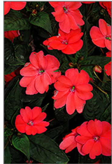
SunPatiens Compact Coral New Guinea Impatiens flowers