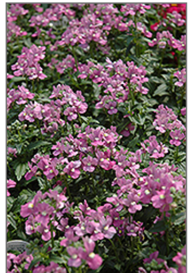
Compact Pink Innocence Nemesia flowers