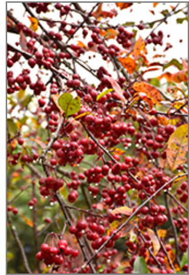
Prairiefire Flowering Crab fruit

Prairiefire Flowering Crab will grow to be about 18 feet tall at maturity, with a spread of 18 feet. It has a high canopy with a typical clearance of 6 feet from the ground, and is suitable for planting under power lines. As it matures, the lower branches of this tree can be strategically removed to create a high enough canopy to support unobstructed human traffic underneath. It grows at a medium rate, and under ideal conditions can be expected to live for 50 years or more.