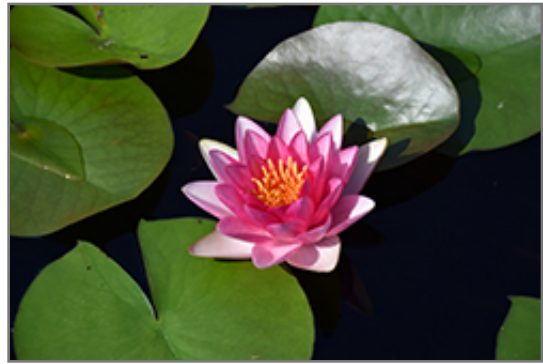
Attraction Hardy Water Lily flowers