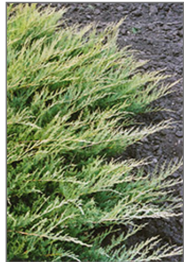
Broadmoor Juniper foliage