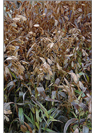
Northern Sea Oats in fall

Northern Sea Oats is recommended for the following landscape applications;