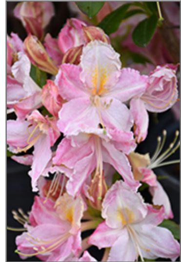
Tri-Lights Azalea flowers