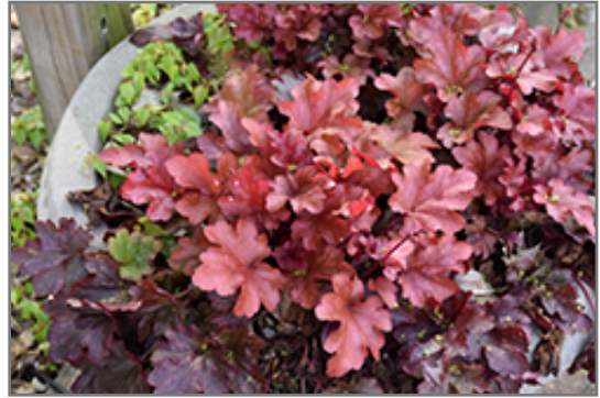
Peach Flambe Coral Bells

Peach Flambe Coral Bells will grow to be about 8 inches tall at maturity extending to 16 inches tall with the flowers, with a spread of 16 inches. When grown in masses or used as a bedding plant, individual plants should be spaced approximately 14 inches apart. Its foliage tends to remain low and dense right to the ground. It grows at a medium rate, and under ideal conditions can be expected to live for approximately 10 years. As an evergreen perennial, this plant will typically keep its form and foliage year-round.