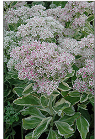
Frosty Morn Stonecrop flowers