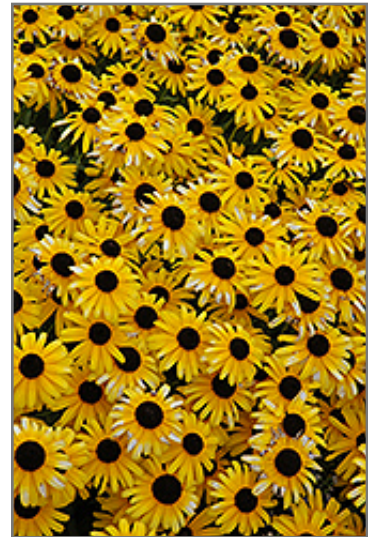
Viette's Little Suzy Coneflower flowers