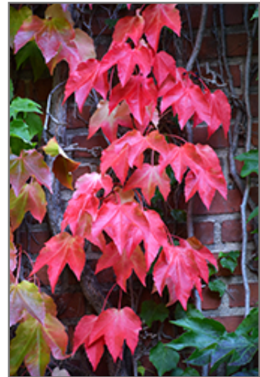
Boston Ivy in fall