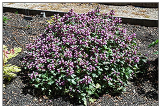
Beacon Silver Spotted Dead Nettle in bloom