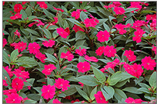
Bounce Cherry Impatiens in bloom