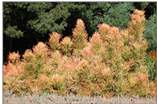
Sticks On Fire Red Pencil Tree