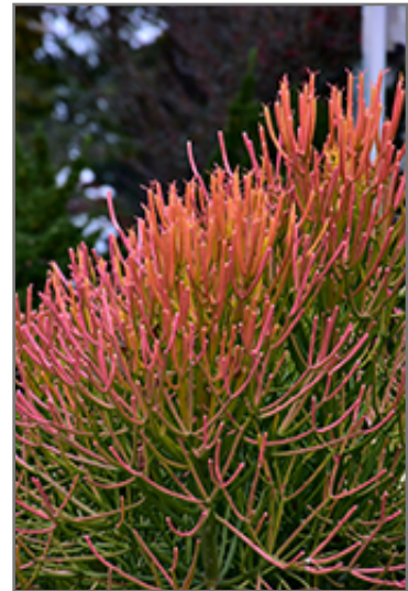
Sticks On Fire Red Pencil Tree foliage

Sticks On Fire Red Pencil Tree is recommended for the following landscape applications;