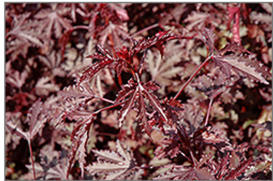
Haight Ashbury Hibiscus foliage