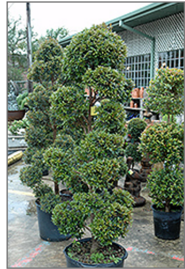
Brush Cherry

Brush Cherry is recommended for the following landscape applications;