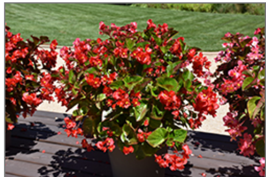
Whopper Red with Green Leaf Begonia flowers