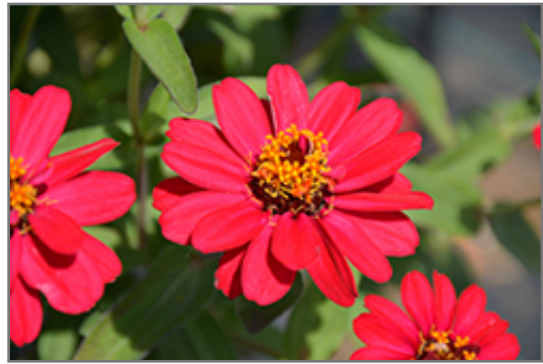
Profusion Double Hot Cherry Zinnia flowers