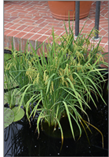
Asian Rice in bloom