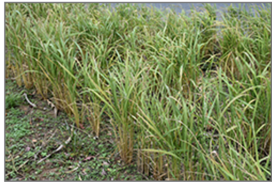
Asian Rice