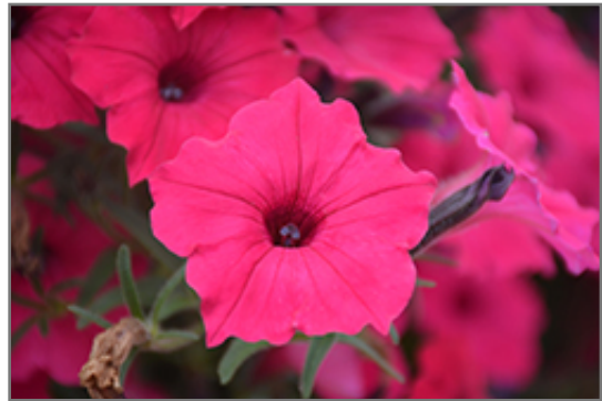
Supertunia Vista Fuchsia Petunia flowers