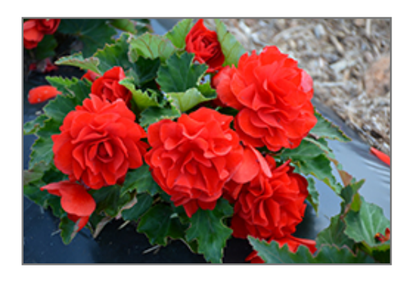
Nonstop Red Begonia in bloom