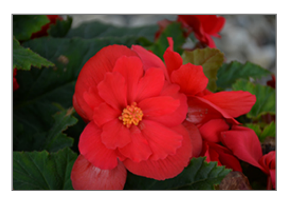
Nonstop Red Begonia flowers