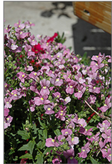
Compact Pink Innocence Nemesia flowers