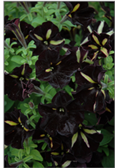
Phantom Petunia flowers