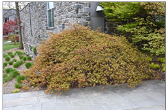
Spring Delight Japanese Maple