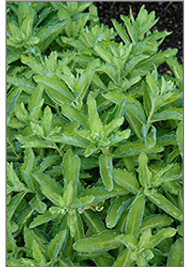
Autumn Delight Stonecrop foliage

This plant does best in full sun to partial shade. It is very adaptable to both dry and moist growing conditions, but will not tolerate any standing water. It is not particular as to soil pH, but grows best in poor soils, and is able to handle environmental salt. It is highly tolerant of urban pollution and will even thrive in inner city environments. This particular variety is an interspecific hybrid. It can be propagated by division; however, as a cultivated variety, be aware that it may be subject to certain restrictions or prohibitions on propagation.