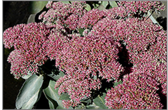
Autumn Delight Stonecrop flowers

Autumn Delight Stonecrop is a dense herbaceous perennial with an upright spreading habit of growth. Its relatively coarse texture can be used to stand it apart from other garden plants with finer foliage.