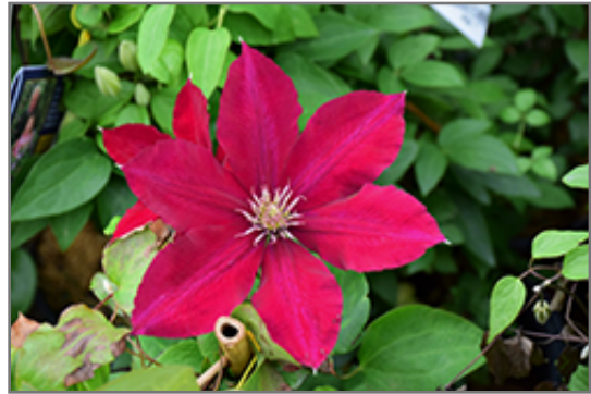
Rebecca Clematis flowers