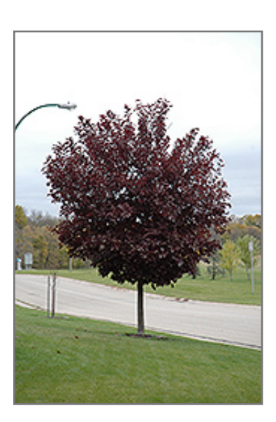
Canada Red Select Chokecherry

This is a high maintenance tree that will require regular care and upkeep, and is best pruned in late winter once the threat of extreme cold has passed. It is a good choice for attracting birds and bees to your yard. Gardeners should be aware of the following characteristic(s) that may warrant special consideration;