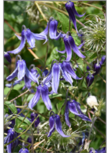
Bush Clematis flowers