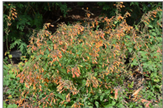
Apricot Sprite Hyssop in bloom