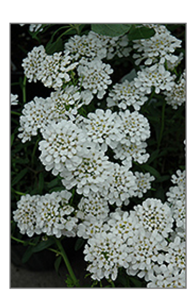
Alexander White Candytuft flowers

Alexander White Candytuft will grow to be about 10 inches tall at maturity, with a spread of 24 inches. When grown in masses or used as a bedding plant, individual plants should be spaced approximately 18 inches apart. Its foliage tends to remain low and dense right to the ground. It grows at a medium rate, and under ideal conditions can be expected to live for approximately 10 years. As an evegreen perennial, this plant will typically keep its form and foliage year-round.