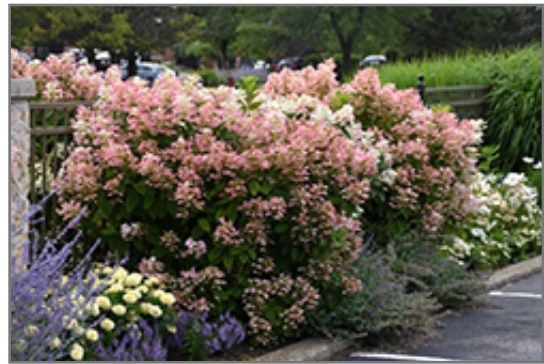
Quick Fire Hydrangea in bloom