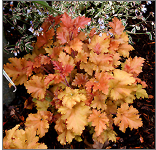
Marmalade Coral Bells foliage

Marmalade Coral Bells will grow to be about 8 inches tall at maturity extending to 18 inches tall with the flowers, with a spread of 16 inches. When grown in masses or used as a bedding plant, individual plants should be spaced approximately 14 inches apart. Its foliage tends to remain low and dense right to the ground. It grows at a medium rate, and under ideal conditions can be expected to live for approximately 10 years. As an evergreen perennial, this plant will typically keep its form and foliage year-round.