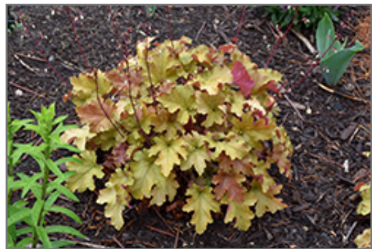
Marmalade Coral Bells