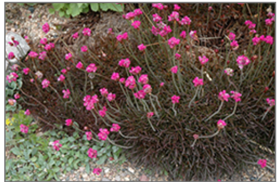
Vesuvius Sea Thrift in bloom