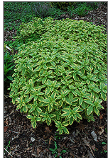
Golden Alexander Loosestrife