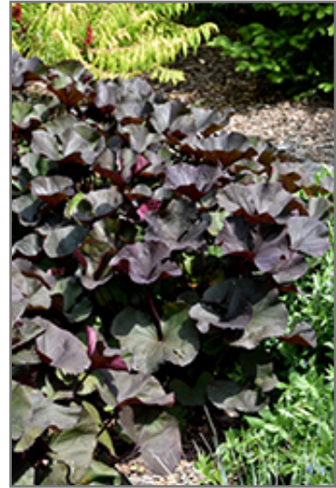
Britt Marie Crawford Rayflower foliage

This plant does best in partial shade to shade. It is quite adaptable, preferring to grow in average to wet conditions, and will even tolerate some standing water. It is not particular as to soil pH, but grows best in rich soils. It is somewhat tolerant of urban pollution. This is a selected variety of a species not originally from North America. It can be propagated by division; however, as a cultivated variety, be aware that it may be subject to certain restrictions or prohibitions on propagation.