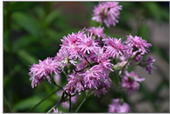
Petite Jenny Ragged Robin Campion flowers

Petite Jenny Ragged Robin Campion is recommended for the following landscape applications;