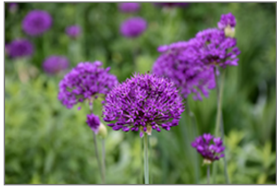
Purple Sensation Ornamental Onion flowers

This is a relatively low maintenance plant, and should only be pruned after flowering to avoid removing any of the current season's flowers. It is a good choice for attracting butterflies to your yard, but is not particularly attractive to deer who tend to leave it alone in favor of tastier treats. It has no significant negative characteristics.