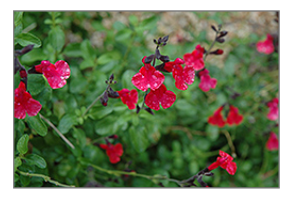
Navajo Red Autumn Sage flowers

7711 S. Parker Road Centennial, CO 80016 303.690.4722 www.tagawagardens.com