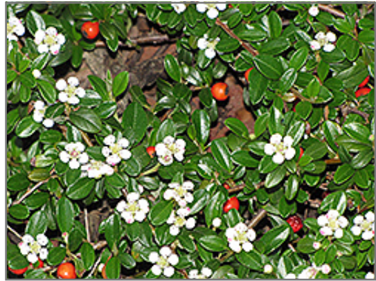
Coral Beauty Cotoneaster fruit

Coral Beauty Cotoneaster will grow to be about 18 inches tall at maturity, with a spread of 5 feet. It tends to fill out right to the ground and therefore doesn't necessarily require facer plants in front. It grows at a fast rate, and under ideal conditions can be expected to live for approximately 30 years.