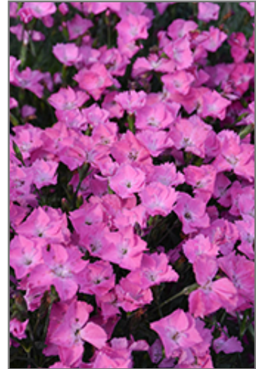
Kahori Pinks flowers

Kahori Pinks is recommended for the following landscape applications;