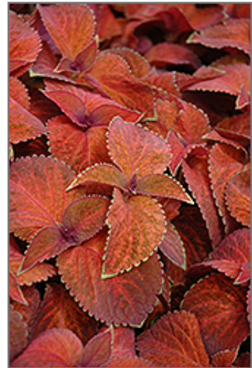
Wizard Sunset Coleus foliage

Wizard Sunset Coleus is recommended for the following landscape applications;