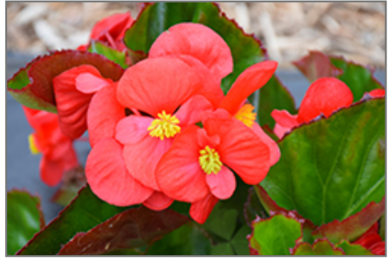
Big Red with Green Leaf Begonia flowers

Big Red with Green Leaf Begonia is recommended for the following landscape applications;