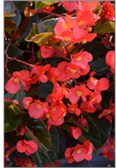
Big Red with Bronze Leaf Begonia flowers

Big Red with Bronze Leaf Begonia is a fine choice for the garden, but it is also a good selection for planting in outdoor containers and hanging baskets. It is often used as a 'filler' in the 'spiller-thriller-filler' container combination, providing a mass of flowers and foliage against which the larger thriller plants stand out. Note that when growing plants in outdoor containers and baskets, they may require more frequent waterings than they would in the yard or garden.