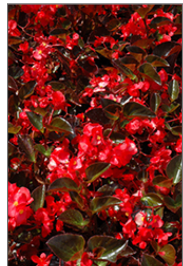
Big Red with Bronze Leaf Begonia flowers