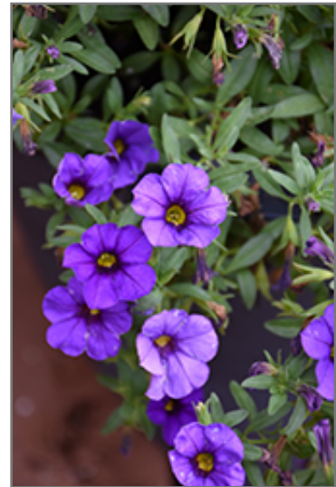
Aloha Kona Midnight Blue Calibrachoa flowers

Aloha Kona Midnight Blue Calibrachoa is recommended for the following landscape applications;