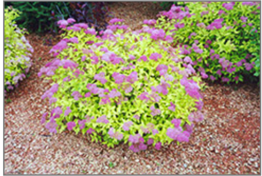
Goldmound Spirea in bloom

This shrub should only be grown in full sunlight. It prefers to grow in average to moist conditions, and shouldn't be allowed to dry out. It is not particular as to soil type or pH. It is highly tolerant of urban pollution and will even thrive in inner city environments. This is a selected variety of a species not originally from North America.