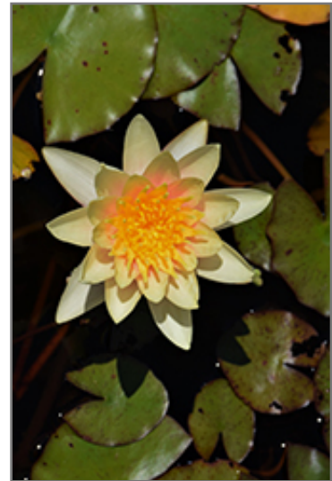
Comanche Hardy Water Lily flowers