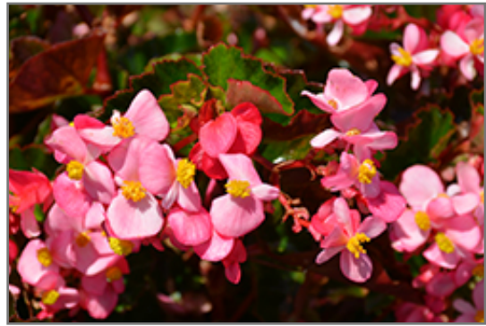
BabyWing Pink Begonia flowers

BabyWing Pink Begonia is recommended for the following landscape applications;