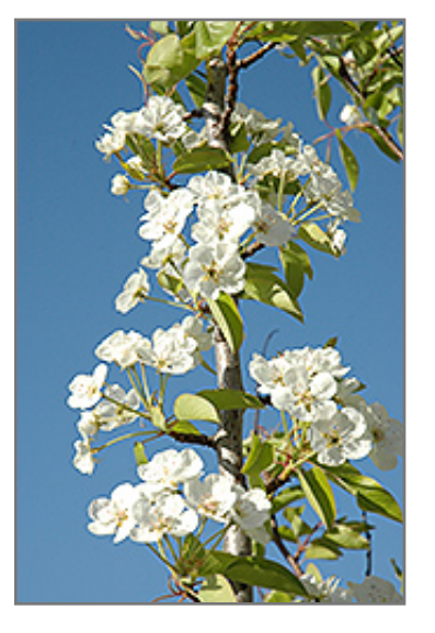
Summercrisp Pear flowers

Summercrisp Pear will grow to be about 15 feet tall at maturity, with a spread of 15 feet. It has a low canopy with a typical clearance of 4 feet from the ground, and is suitable for planting under power lines. It grows at a fast rate, and under ideal conditions can be expected to live for approximately 30 years. This variety requires a different selection of the same species growing nearby in order to set fruit.