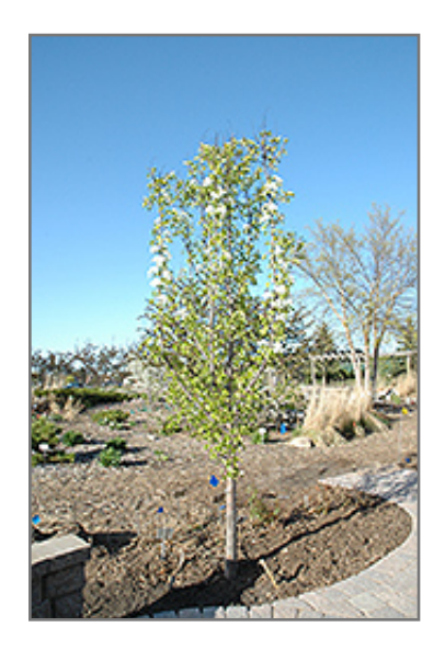
Summercrisp Pear in bloom