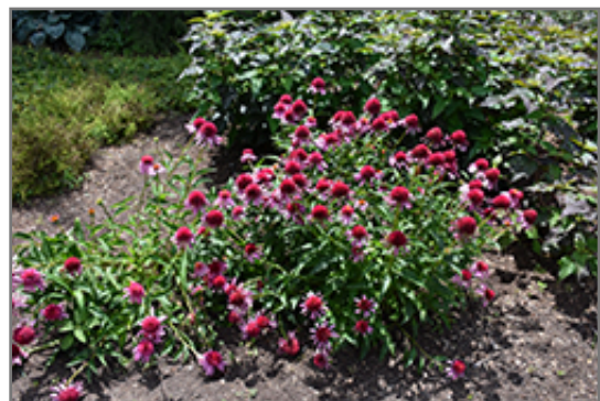
Double Scoop Bubble Gum Coneflower in bloom